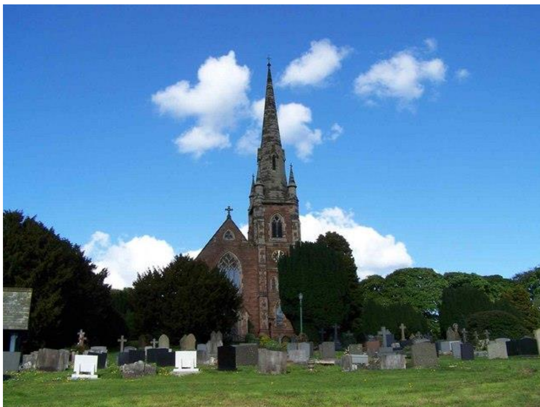
St. John the Baptist Church, Keele, Staffordshire

St. John the Baptist Churchyard, Keele, Staffordshire contains only two War Graves, both relating to World War 1 – the other death occurred in 1919.