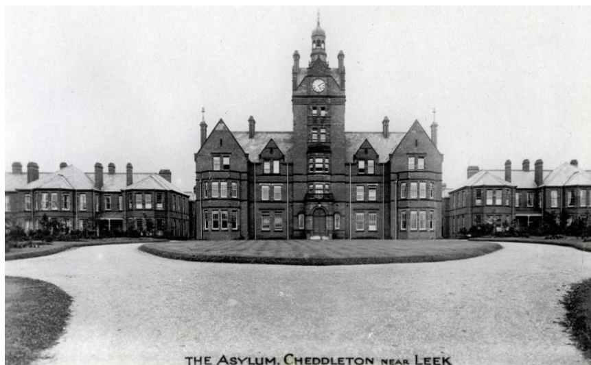
Staffordshire Asylum, Cheddleton – St. Edward's Hospital